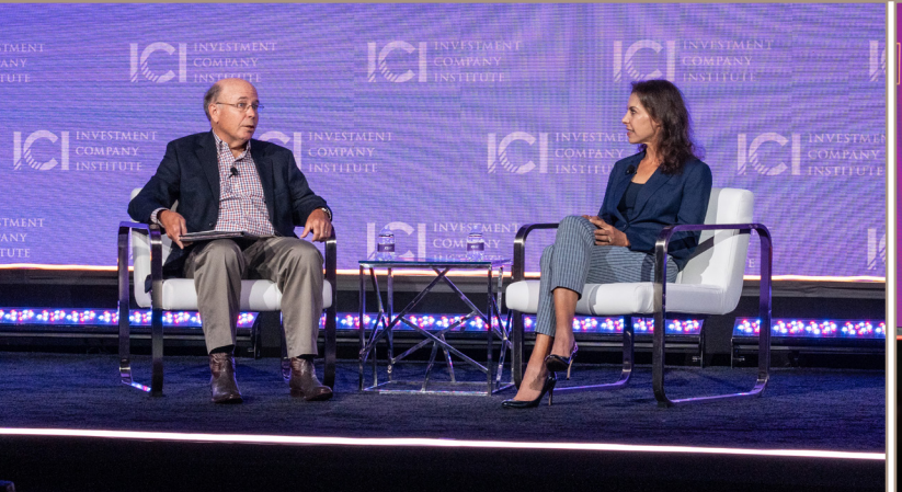
2022 ICI Tech Summit