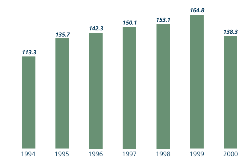
figure 4 Closed-End Fund Assets, 1994–2000 (billions)

source: Investment Company Institute Annual Closed-End Fund Survey